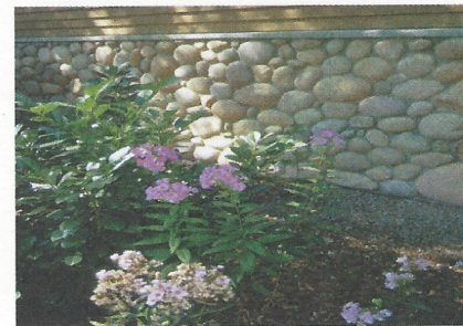
Use faux brick and stone finishes and high-moisture-content annuals and perennials.