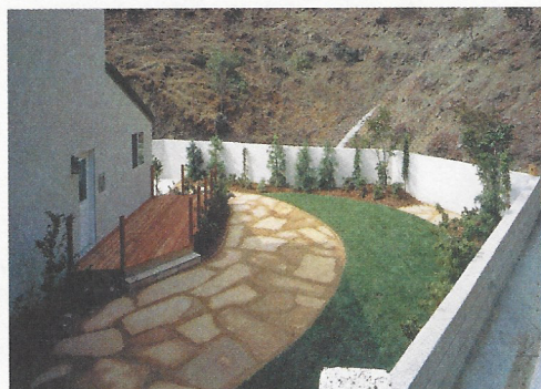
Create a cinder block wall around the perimeter of your yard and use grass and slate to break up the landscape.