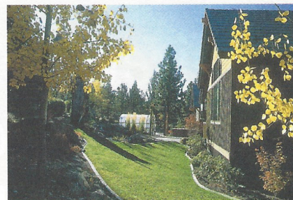
Use grass and driveways as fuel breaks from the house.