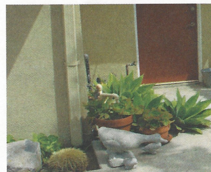
Use groupings of potted plants that include succulents and other drought resistant vegetation.